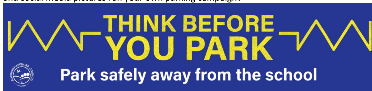
Considerate Parking Banner

Why not borrow one of our parking banners, and, along with the Parents Parking Promise and social media pictures run your own parking campaign?