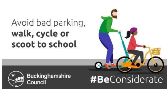
Image suggesting avoiding bad parking, walk, cycle or scoot to school instead