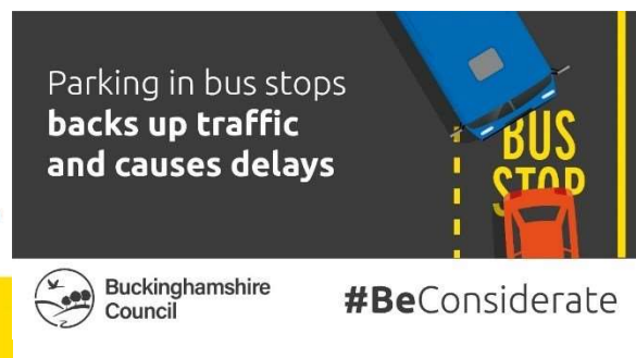
Image demonstrating that parking in bus stops backs up traffic and causes delays.