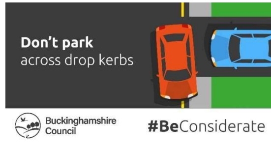
Image requesting people not to park across drop kerbs.