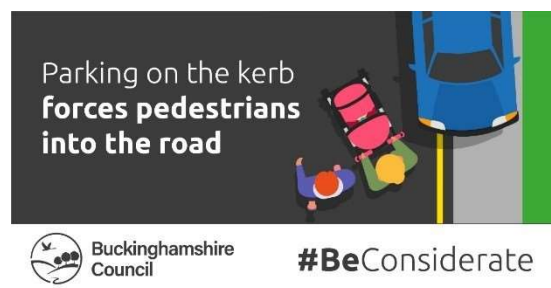
Image demonstrating that parking on the kerb forces pedestrians into the road.

Please contact schooltravelplanning@buckinghamshire.gov.uk for more information.