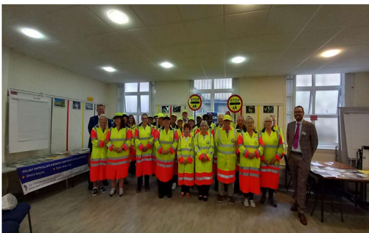
Buckinghamshire Council's School Crossing Patrollers