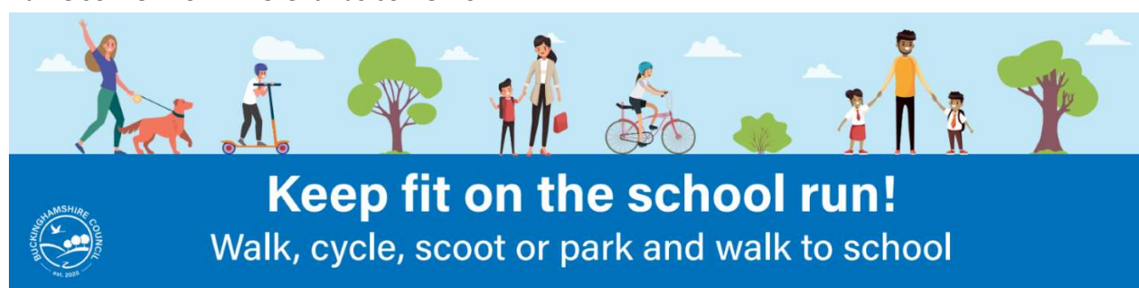
Primary School Banner

To borrow a banner, please email schooltravelplanning@buckinghamshire.gov.uk with your school's name, address, and School Travel Plan Coordinator's name. We do have limited numbers and banners will need to be returned to us, so they can be available for other schools to use. If you have borrowed one, please can you move it around the school site, so it does not become 'blind' to passers-by. Alternatively please return it in your school's bag, remembering to include your school's name, address, and School Travel Plan Coordinator's name so we know where it has come from.