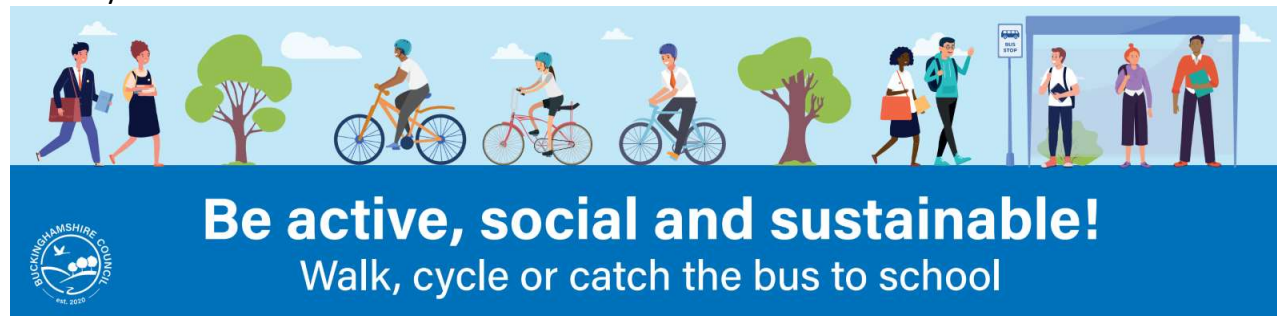
Secondary School Banner

Why not borrow one of our parking banners, and, along with the Parents Parking Promise and social media pictures run your own parking campaign?