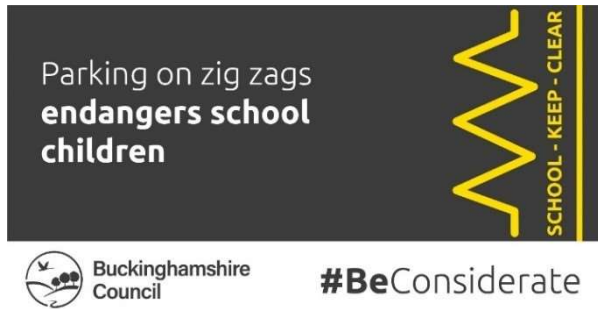
Image demonstrating that parking on zig zags endangers school children.

We also have images you can use on your social media channels and newsletters to support considerate parking: