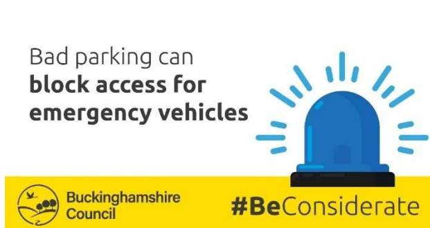
Image demonstrating that bad parking can block access for emergency vehicles.